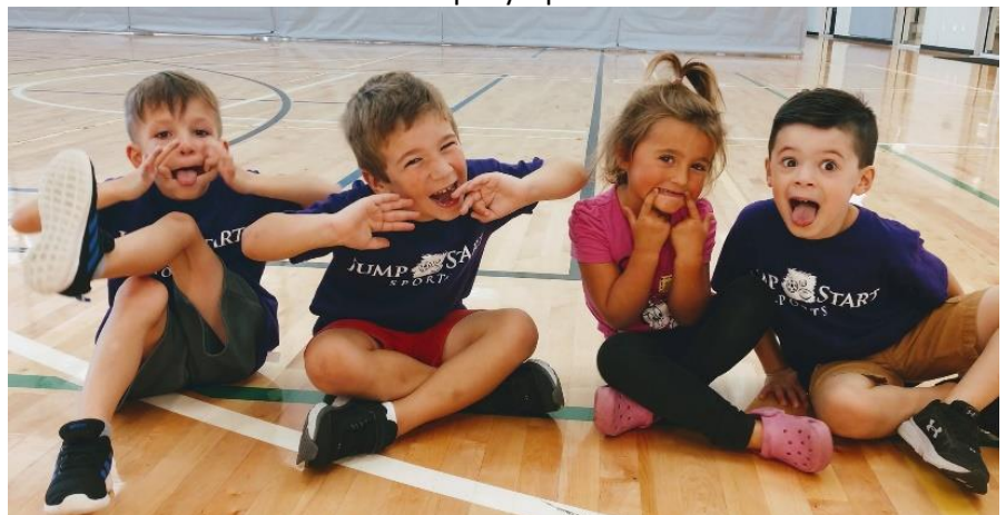
Jump Start Sports, a Bell Buckle Holdings subsidiary